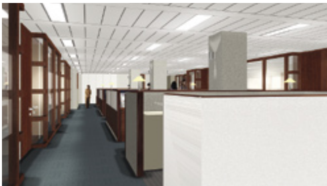
VISUAL OF OFFICE AREA

Extensive three-dimensional computer modelling helped us to create a classic, timeless business environment in close partnership with CVC. Quality is evident in the beautiful detailing and materials – a fusion of wood, stone and glass. To finish off the scheme, we specified high quality 'Casegoods' style furniture, with matching bespoke meeting room suites.