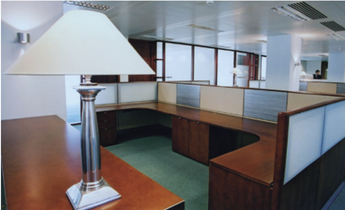
OFFICE AREA DETAIL

Beneath the calm finishes is a technically sophisticated installation; CVC have to deal with highly confidential matters so a high degree of acoustic integrity had to be maintained within and between individual offices and meeting rooms. This, together with the need for a full 'catering kitchen' facility, demanded an exacting design and specification for the mechanical systems.