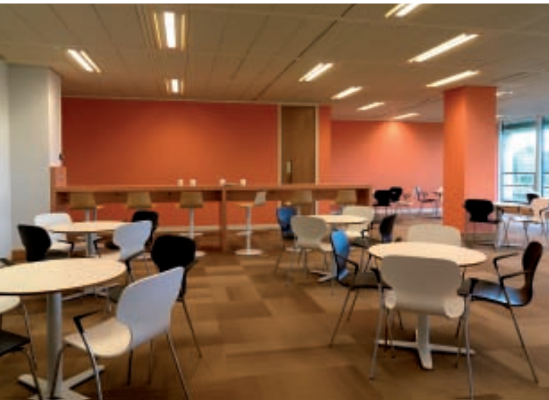
Break out Area

When Boston Scientific decided to co-locate two of their offices, Hemel Hempstead was chosen as an ideal location. Working closely with their Project Managers, Turner Legg Consulting, we created an environment that met their needs, providing a large number of training and meeting areas, along with office accommodation that was comfortable, yet maintained their high corporate standards. The result is a truly stunning project, delivered on time and within budget.