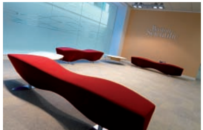
Soft seating area